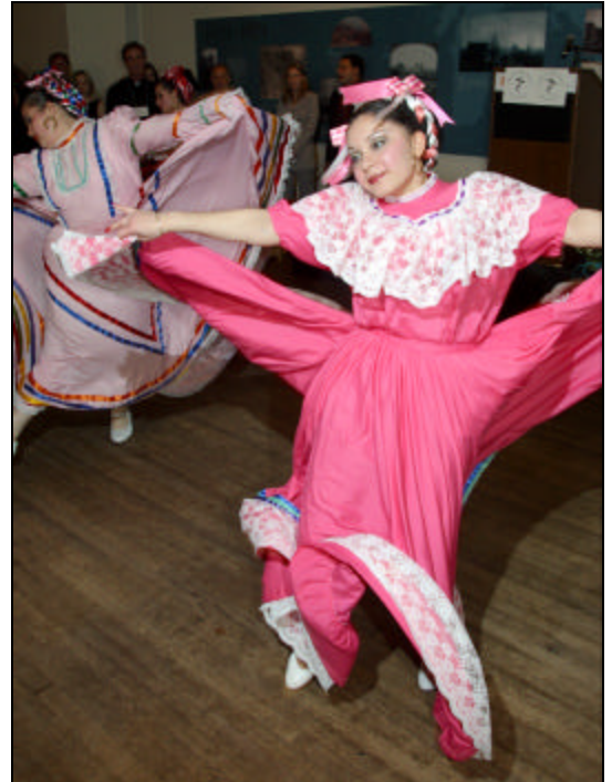
The Cristo Rey Ballet Folklorico dancers wowed the crowd again with their performance at the 2004 ¡VIVA! Scholarship Fundraiser